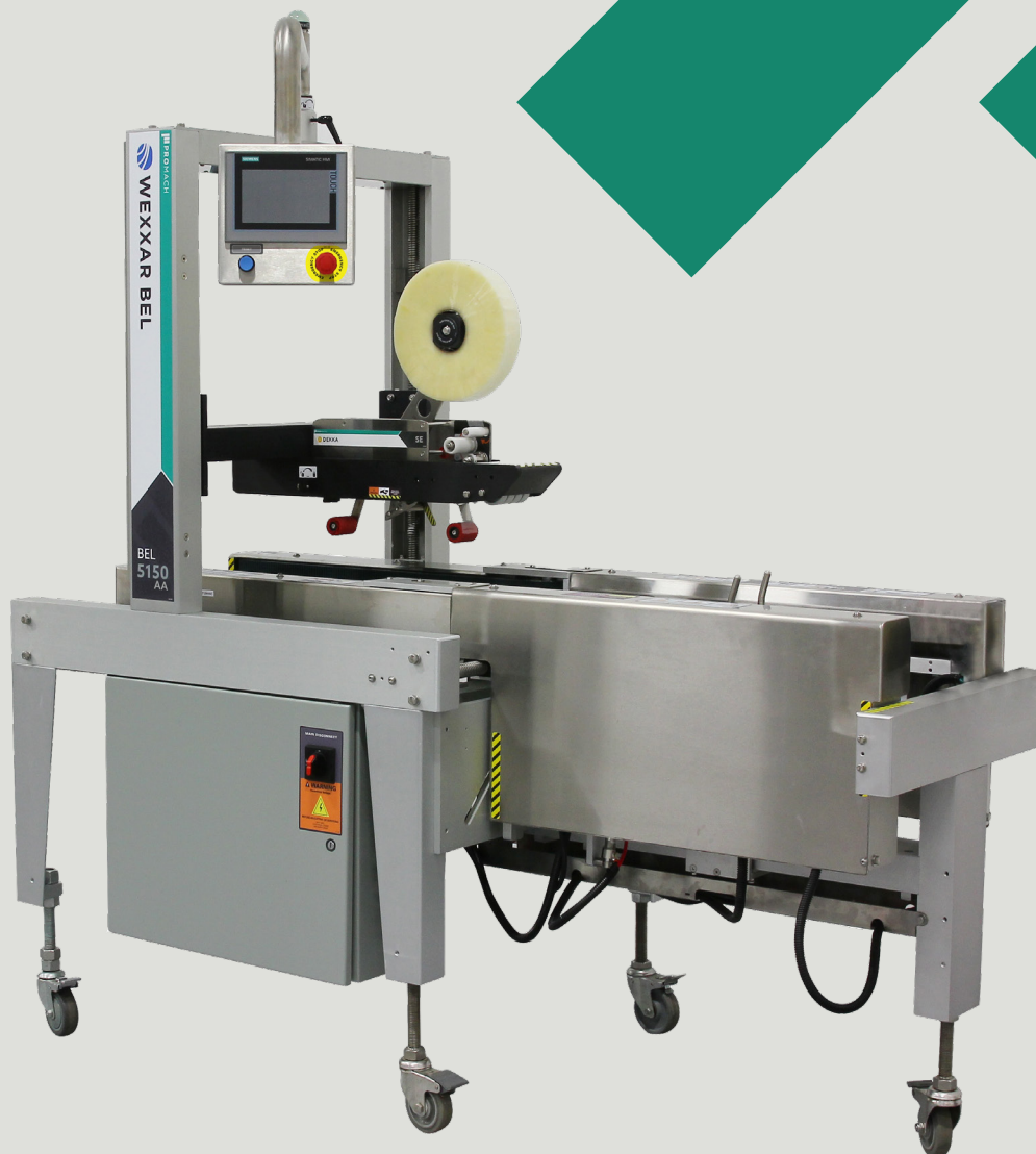
*picture shown with optional casters