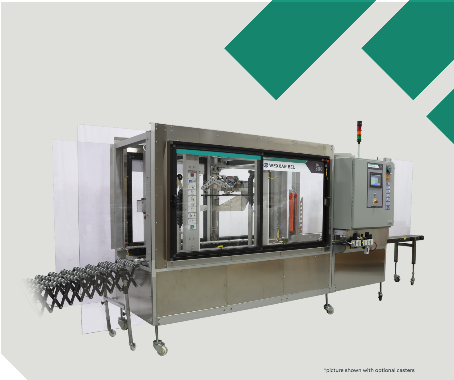
*picture shown with optional casters